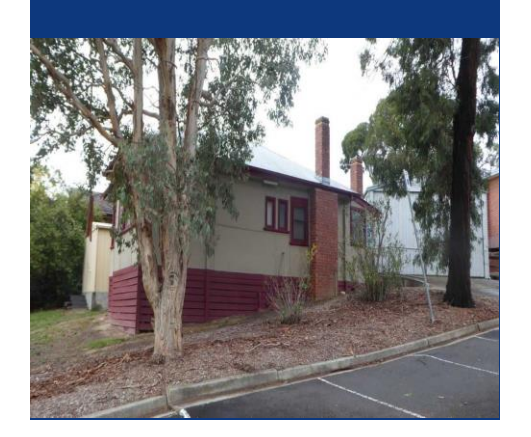
Diamond Valley Gem Club Inc.

Monday: 7.00 – 9.00 pm Tuesday: 10.30 – 3.00 pm Tuesday: 7.00 – 9.00 pm Thursday: 7.30 – 10.00 pm Saturday: 1.30 – 4.30 pm