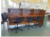
Fig 24. Fitted out lockable work bench

We are currently looking at making ramps for the entry to the club buildings.