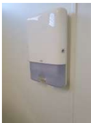
Fig 2 Paper towel dispenser

We took possession of the building in March 2021 and signed a lease for new club rooms