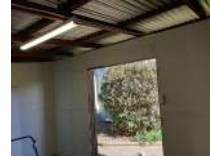
Fig 26. Inside lined shed