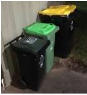
Fig 13. Club's bins.

We bought a worktable and lockable cupboard for the Gemmology equipment. Refer Fig 15