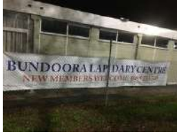
Fig 6 Club banner on fence