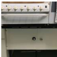
Fig 19. Under stove cupboard door