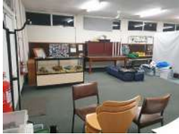
Fig 8. East end southern wall.

We erected the club banner on the southern fence and secured it with stainless ties. Refer Fig 6.