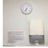
Fig 26. Clock and paper towel dispenser