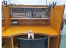
Fig 25. Workbench tool safe and lighting