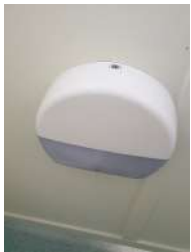
Fig 1 toilet roll dispenser