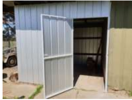
Fig 7. Enclosed shed & fit lockable door