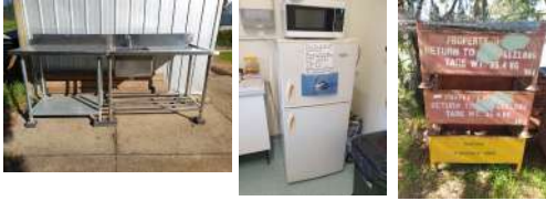
Fig 21. Wash station.