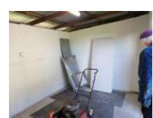
Fig 27. Looking out of the lined shed