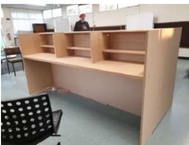
Fig 5 New work bench