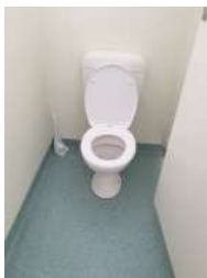
Fig 4 Toilet Seats fitted