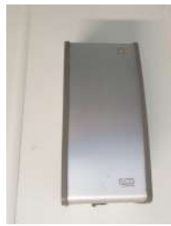
Fig 3 Soap dispenser

Sept 2021 We ordered a club banner to promote the club which will hang off the southern fence.