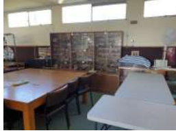
Fig 11. Display cabinet.

We fixed the external blind over Kitchen window and fitted café curtains on the inside. Refer Fig 12.