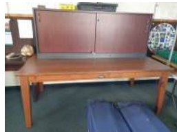
Fig 15. Table and lockable cupboard