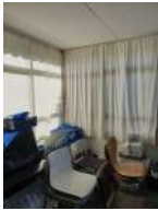
Fig 14. Internal curtains

We fitted a free standing cabinet in the kitchen and made/ fitted a lockable door to shed.