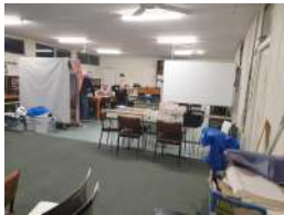
Fig 10. Looking down northern wall.

We transferred Items from the old club into the new club house. Refer Fig 8, 9, 10 & 11.