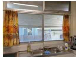
Fig 12. blinds & curtains.

We erected window coverings in main room and office for security reasons. Refer Fig 14.