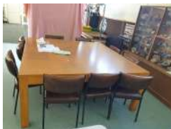
Fig 20. Refurbished large work table

We fitted a wall clock on existing hook and glued with silicone a paper towel dispenser on the Kitchen wall. Fig 26