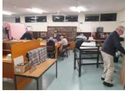
Fig 9. West end southern wall

Enclosed the opened part of shed and construct lockable door and jam for it. Refer Fig 7.